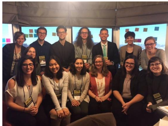
2018 Student Affairs Advisory Board

Have a great start to the new year and new semester!